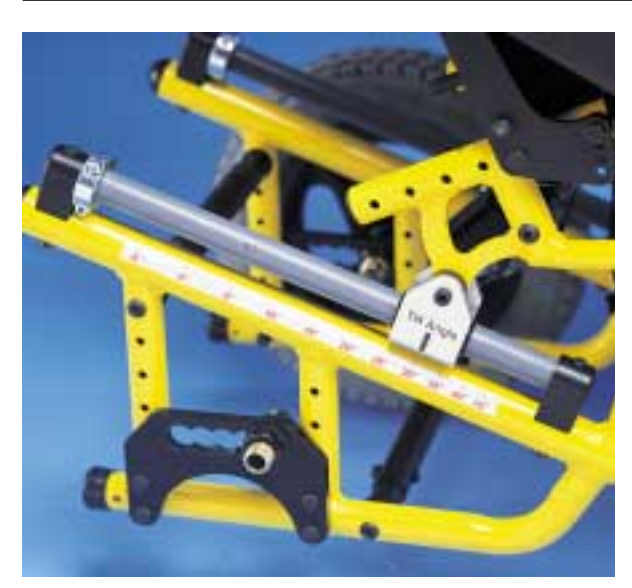
Tilt-angle indicator decal allows caregiver to set the correct tilt angle every time.